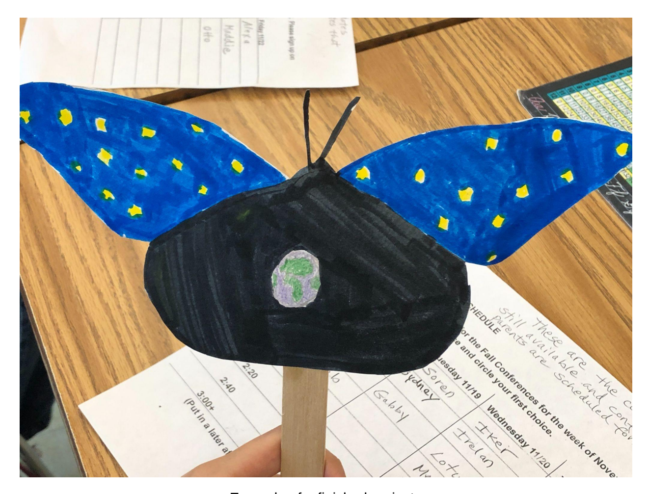
Example of a finished project.