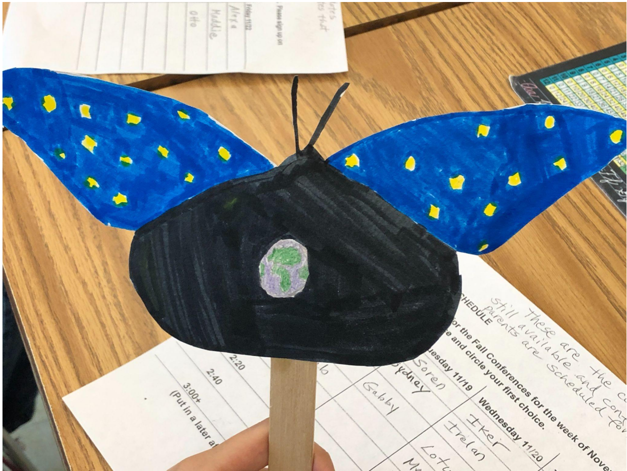
Example of a finished project.